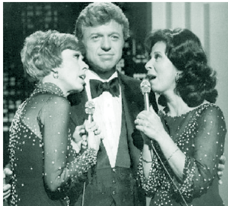
From left, Carol Burnett, Steve Lawrence, and Eydie Gorme during a tribute special to Irving Berlin on the 'Carol Burnett Show.'