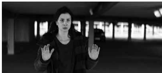
Aylin Tezel portrays Commissioner Alex Enders in 'Unbroken.'

Set in the mystical world of San Candido, One Step From Heaven (Italian) is a captivating series in which love, nature, and friendship intertwine in fascinating ways. Season 2 begins Dec. 29.