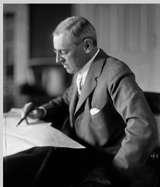
▲ President Woodrow Wilson writing at his desk.

sion of Congress and asked for a declaration of war against Germany, proclaiming that "the world must be made safe for democracy."