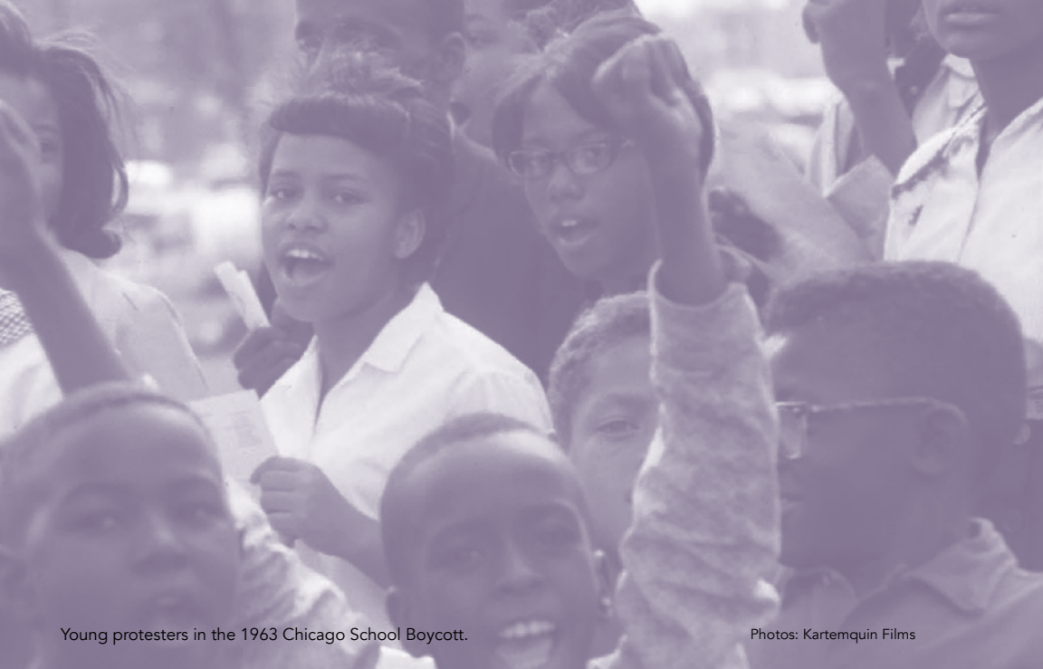
Young protesters in the 1963 Chicago School Boycott.