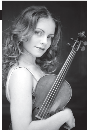
▲ Julia Fischer plays violin with the Chicago Symphony Orchestra at 7 pm Tuesday, March 21