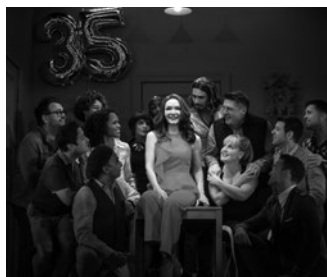
Keeping Company with Sondheim , May 27