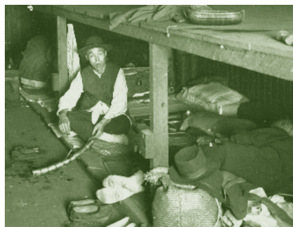
A basement in Chinatown, San Francisco, California. 1900.

American Experience tells the gripping story of the desperate race against time to save San Francisco and the nation in Plague at the Golden Gate at 8 pm Tuesday, May 24.