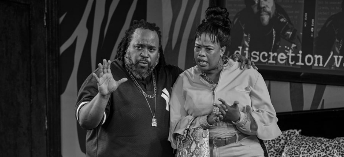
Merry Wives , May 20