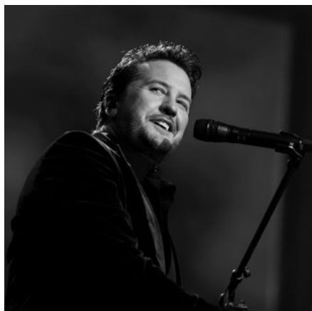
Luke Bryan is one of the guest artists paying tribute to Lionel Richie.

Pop music icon Lionel Richie received the Gershwin Prize at an all-star tribute concert in Washington, D.C., in March. That concert, Lionel Richie: The Library of Congress Gershwin Prize for Popular Song , airs at 8 pm Tuesday, May 17.