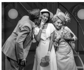
Anything Goes , May 13

Keeping Company with Sondheim on Great Performances is featured May 27. Filmed over two years, this documentary takes an exclusive inside look at Tony Award-winning director Marianne Elliott’s creative process of bringing a reimaged gender-swapped production of Stephen Sondheim and George Furth’s musical “Company” to Broadway during the COVID-19 pandemic. It features rehearsal and performance footage.