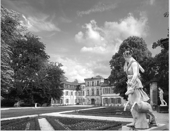
▲ Garden Museum Schloss Fantaisie - Ecker Village/Donndorf at Bayreuth

We'll fly to Frankfort and visit the magnificent Prince Bishops Palace in Würzburg, then we'll travel to Schwetzingen and Heidelberg, where we take a funicular railway up to majestic ruined Schwetzingen Castle. We boat to Veitshoecheim's Rococo Garden with its 200 statues. visit the Bavarian Wine and Garden Institute; and stay overnight in Bayreuth to see its gardens. We visit Freising's Weihenstephan Gardens with fox tail lilies and stachys, and have dinner at the garden of a brewery founded in the Middle Ages. After spending time in Munich, we head for the Alps and Upper Bavaria, where we see Linderhof Castle, and visit a typical private "Schrebergarten" to see how the locals are growing flowers in their small patches of green.