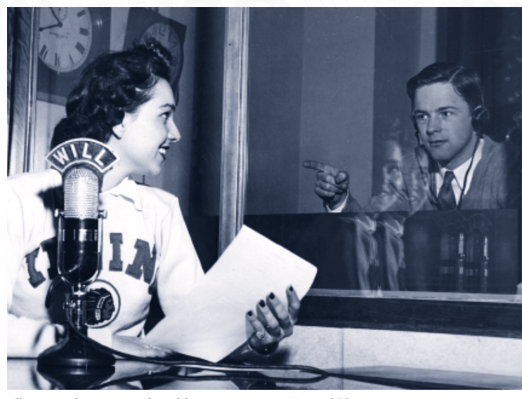
Illinois students get real-world experience at WILL in 1950.

Today, those in central Illinois often look to WILL as a trusted source of local, state. and national news. But news wasn't always a main focus of WILL. Sure, early broadcasts featured headlines from the Associated Press, campus announcements, and Illini sports results, but the news coverage was certainly not the in-depth, multimedia resource we rely on today.