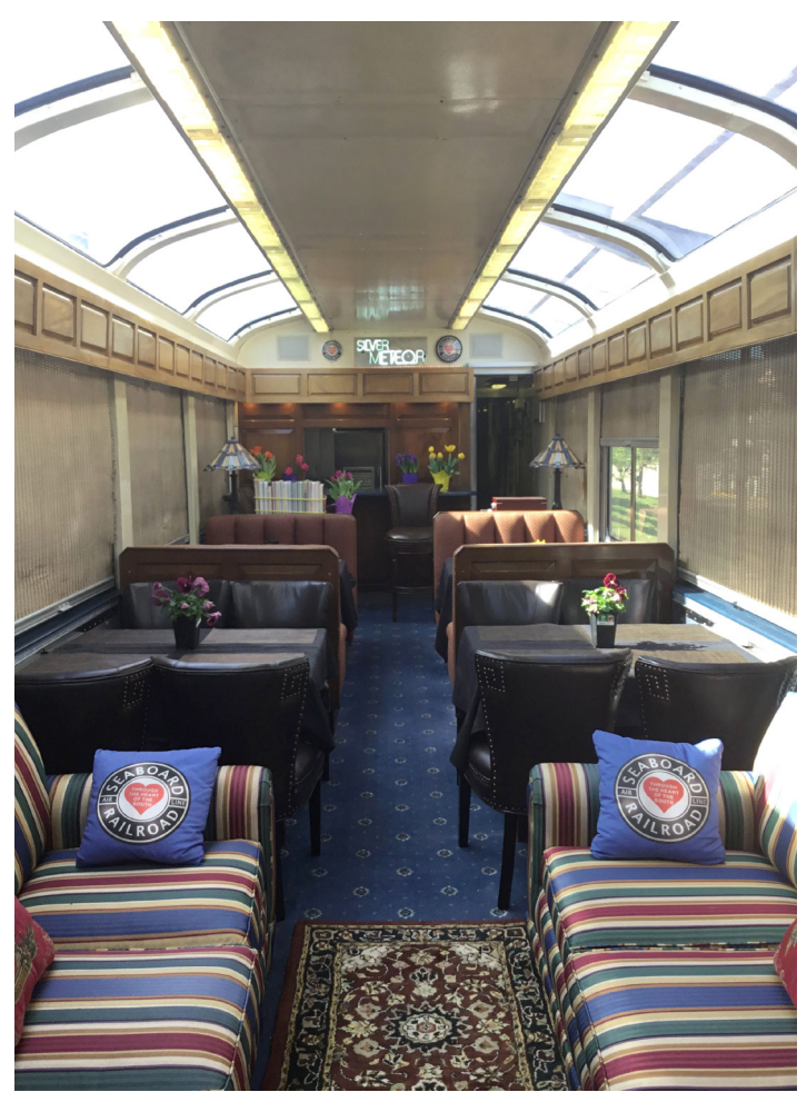
Hollywood Beach vintage rail car (lounge shown)