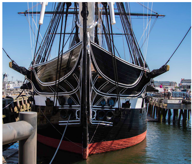
Above: USS Constitution