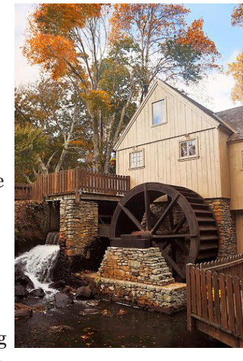
The House of Seven Gables, Salem

front of the economy. The railway incidentally arrived in Marblehead in 1871, now a posh and upscale residential area; this was also the birthplace of the Continental Navy. At infamous Salem, the site of the 1692 Witch Trials, our guided sightseeing includes the cemetery and Judge's Chambers also known as the Witch House, the only structure still standing associated with the trials. Then we continue to the House of Seven Gables made famous by Nathaniel Hawthorne's gothic novel of the same name featuring the struggle of Hepzibah Pyncheon and family. Enjoy a tour of this mansion built in 1668 by merchant ship-owner, John Turner. Our last stop is at the waterfront, the Salem Maritime National Historic Site which consists of 12 historic structures and one replica tall-ship. (B)