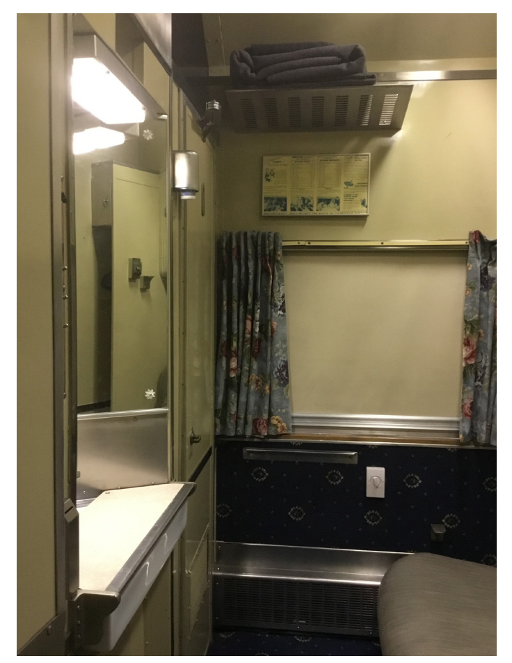
Double bedroom by day, above; by night, below