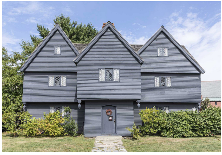
Below: Salem's Witch House