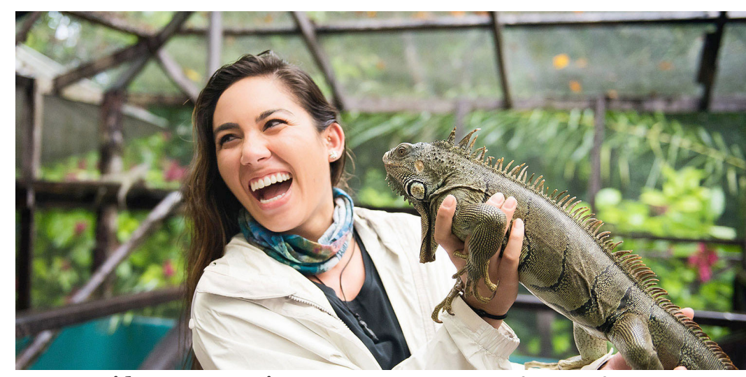
Day 8 Friday: San Ignacio-Belize City-Chicago-Central Illinois

The time has come to bid a fond farewell to Belize. We travel back to the airport for our flight home and take with us memories of warm Belizean hospitality. On arrival at O'Hare, our private motor coach returns us to Central Illinois. (B)