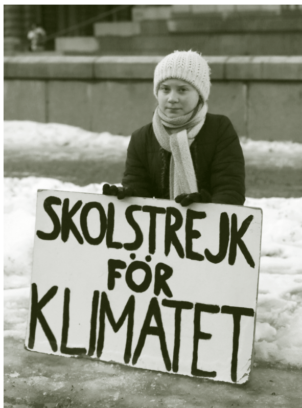
Greta Thunberg in Stockholm, Sweden

The program also examines possible solutions, including the latest innovations, technology, and actions individuals can take to prevent further damage. Climate Change—The Facts premieres at 7 pm Wednesday, April 22.