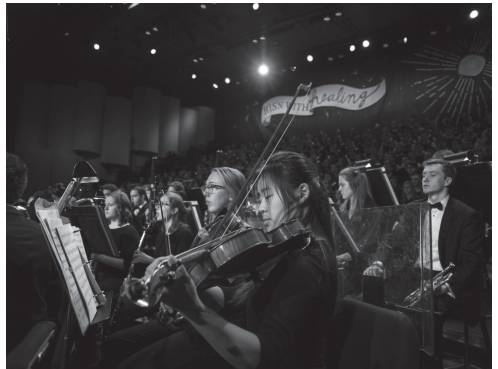
▲ Celebrate Christmas Eve with The St. Olaf Christmas Festival at 7 pm Monday, December 24.