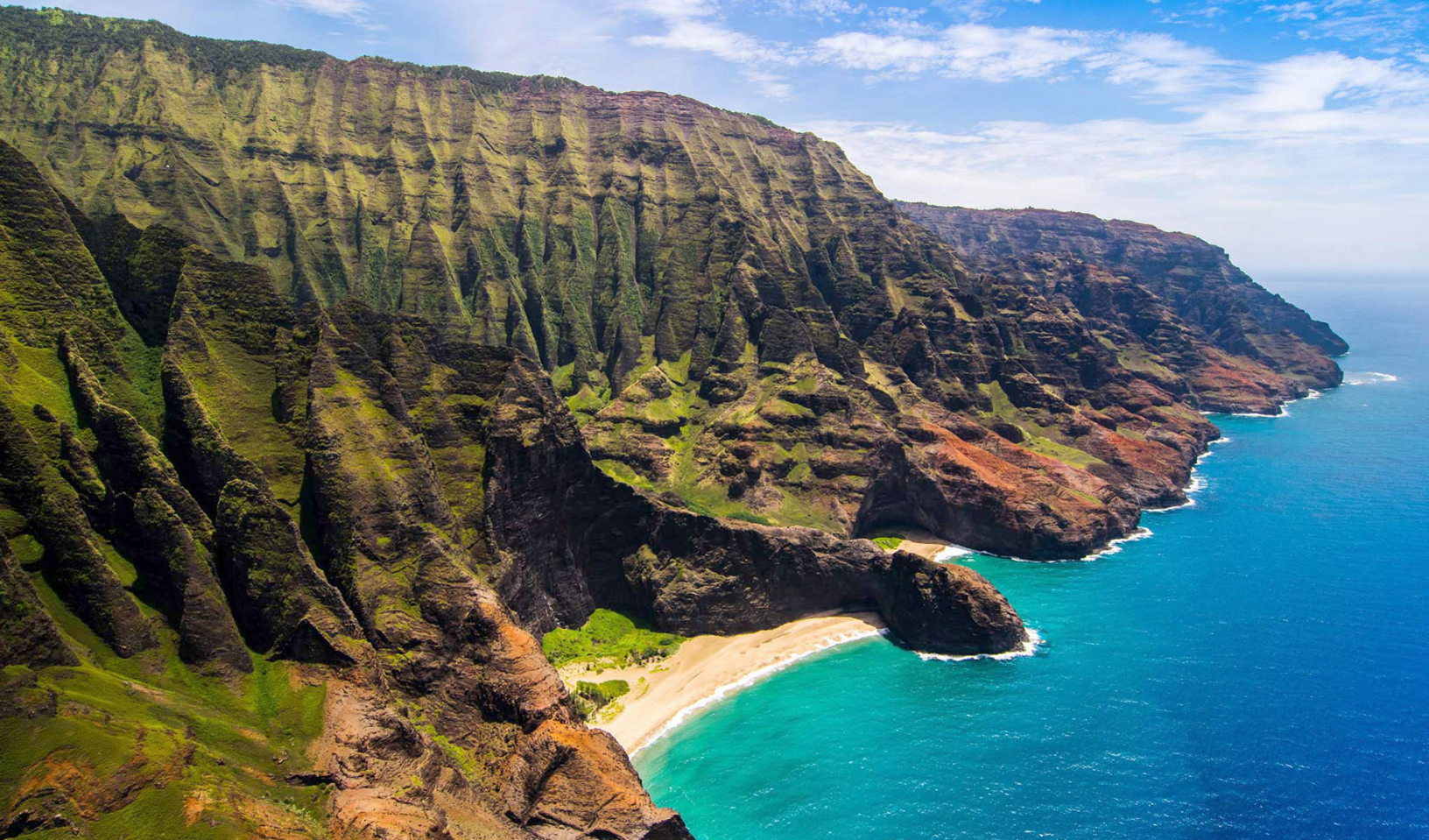
Above: Na Pali coast

lunch as you awe at the beauty that surrounds you.