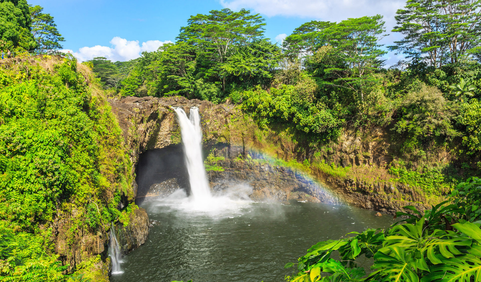
Above: Rainbow Falls; below: Coffee beans at Greenwell Farms Plantation