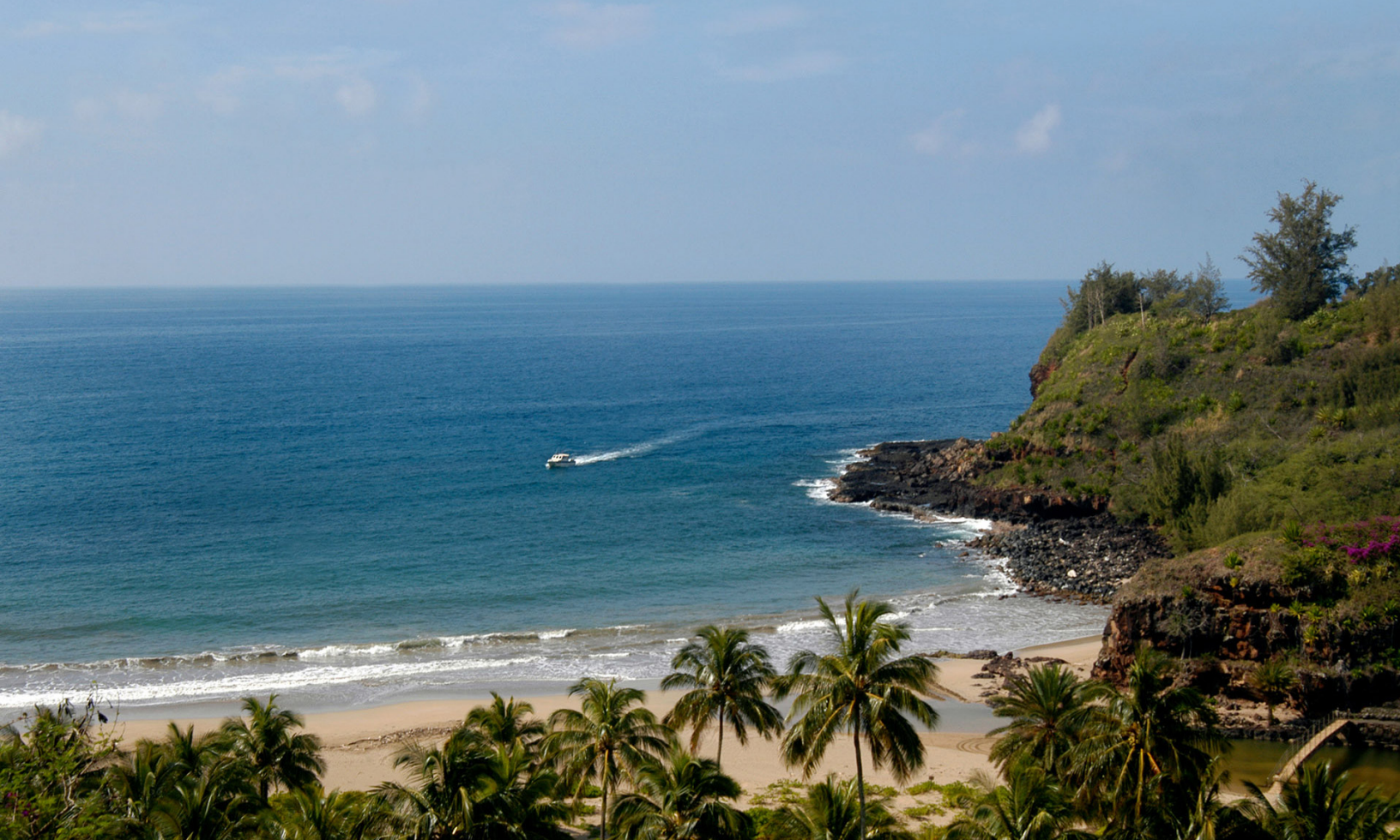
Above: Allerton Garden