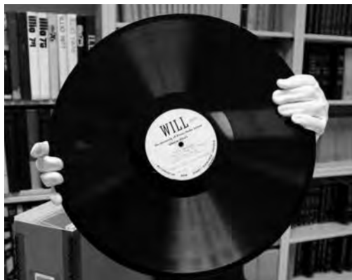
A University of Illinois archivist holds up one of the thousands of 16-inch transcription discs that WILL used to record programs during the 1940s and '50s. WILL Radio will feature highlights from its archive throughout 2022, to mark the station's centennial.