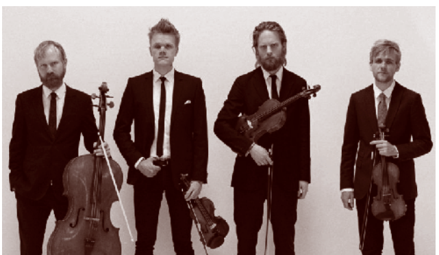
▲ The Danish String Quartet performs Beethoven and Nielsen at 7 pm Sunday, June 21.