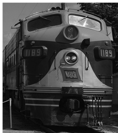
Exhibit Cars - Picnic Grove - Gift Shop