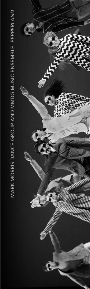
MARK MORRIS DANCE GROUP AND MMDG MUSIC ENSEMBLE: PEPPERLAND