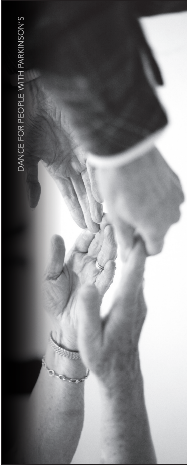
DANCE FOR PEOPLE WITH PARKINSON'S

2 Reading Day at KCPA 17 Dance for People with Parkinson's