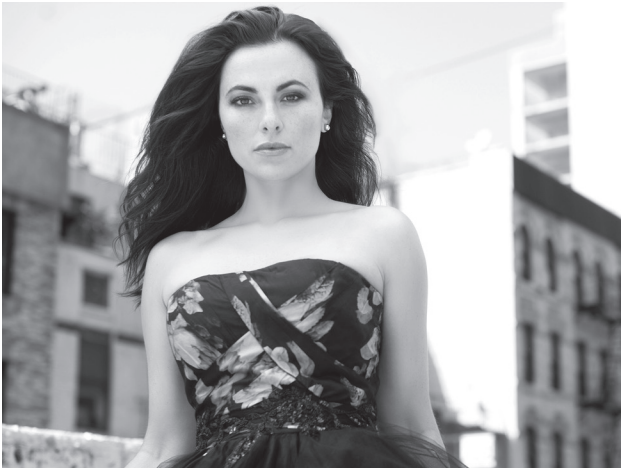
◀ Isabel Leonard performs Mozart and Mahler with the San Francisco Symphony at 7 pm Wednesday, May 22