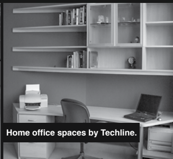
Home office spaces by Techline.

Green Street Studio, Inc. furniture and cabinetry for home and office