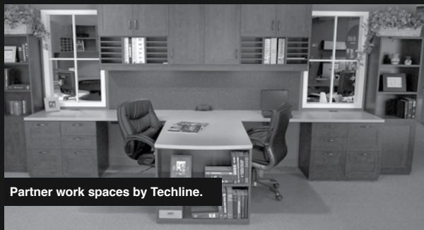
Partner work spaces by Techline.