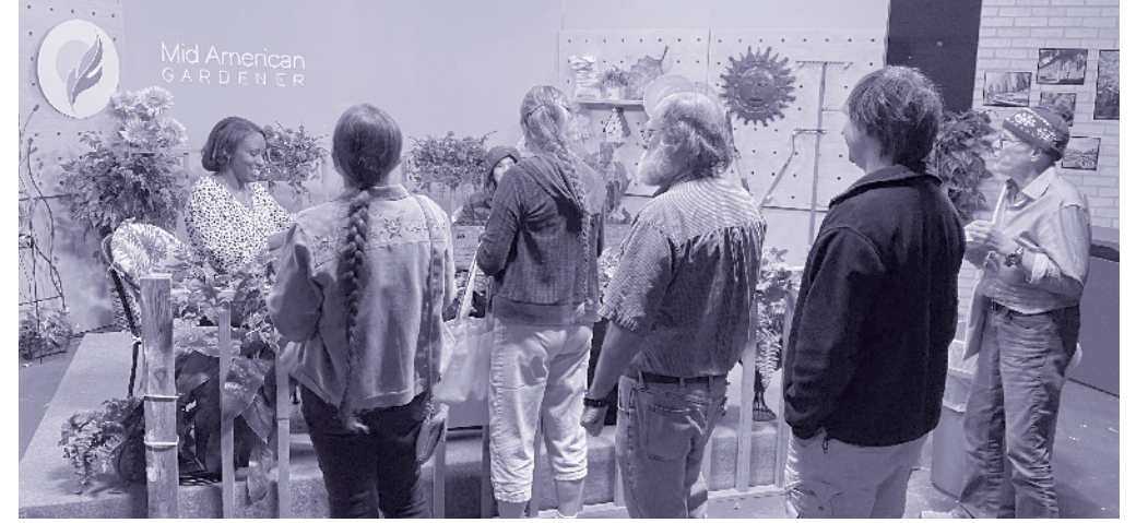
Visitors line up to meet 'Mid-American Gardener' host Tinisha Spain on the set of the show in the Collins Studio.