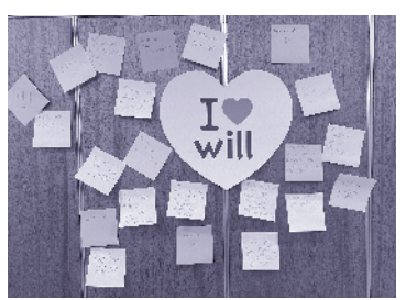
As a part of the tour, visitors were encouraged to leave a note sharing a favorite program, favorite thing about Friendsgiving, or an impact IPM has had on their lives.

programs, projects, and initiatives. Thanks to the community's interest in what we do at IPM, this was the most successful Friendsgiving to date, and staff members are already buzzing about what next year might look like.