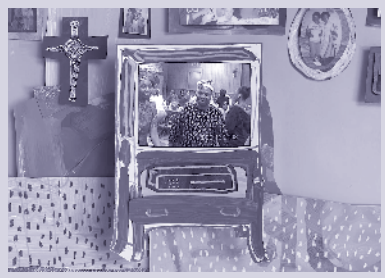
In episode 4, a Nigerian community in Detroit explores the future of their social club.