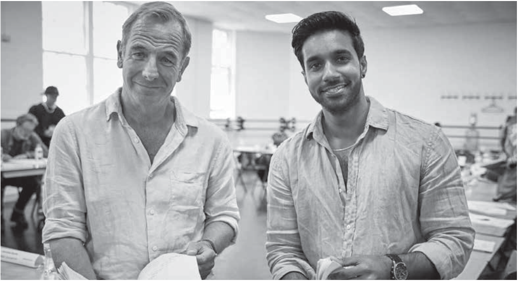
Tom Brittney and Rishi Nair on the set of 'Grantchester.'