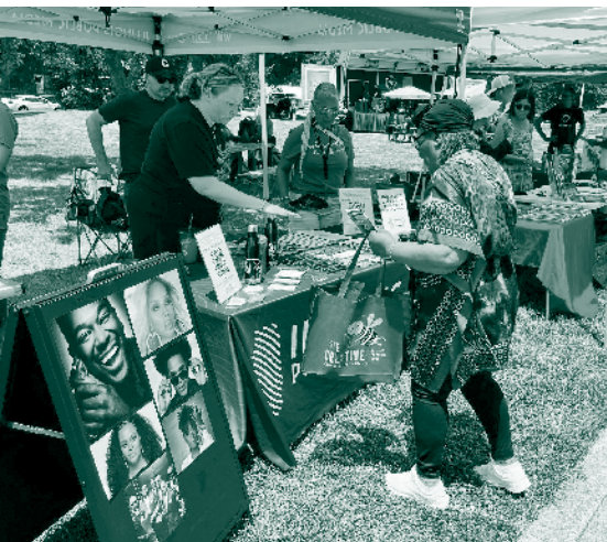
Illinois Public Media celebrates Juneteenth in 2023.

Enjoy free food, live entertainment, kids' activities, raffle prizes, and a wealth of resourceful information provided by various local nonprofits. Rain or shine, the fun goes on! This free event is presented by the Urbana Park District.