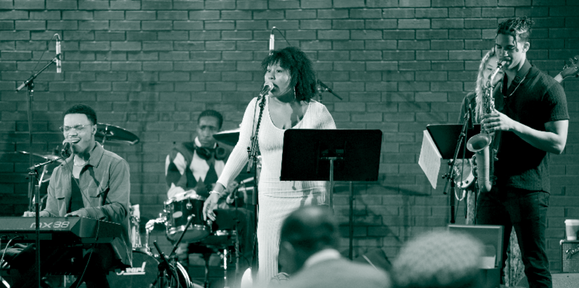
Illinois Soul Day at UNCORKED at Krannert Center in February.