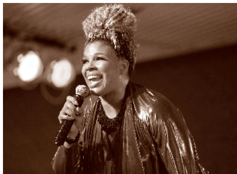
Chicago native and national recording artist Syleena Johnson performed at our Uncorked Juneteenth celebration last year with record-breaking attendance.

Join us on Wednesday, June 18 for the second annual Illinois Soul Juneteenth communitywide concert in conjunction with Krannert Center for the Performing Arts. This free celebration on the eve of Juneteenth will be from 6–7:30 pm on Krannert Center's Stage 5. Join us to celebrate the holiday that commemorates the end of slavery in the U.S. Stay tuned to Illinois Soul for our big artist announcement. There will be plenty of promotional giveaways, along with a cash bar. Join us immediately following the concert for the "official" after party at Neil Street Blues, 301 N. Neil St. #106 in downtown Champaign.