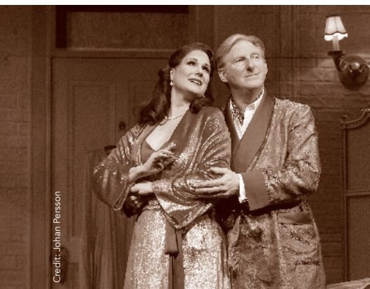
Stephanie J. Block and Adrian Dunbar.

Great Performances presents last year's West End production of Kiss Me, Kate , a "Golden Age" Broadway musical comedy that centers on a battle of the sexes behind the scenes of a production of Shakespeare's "The Taming of the Shrew." The original production was Cole Porter's most successful musical and opened on Broadway in 1948, running for more than 1,000 performances. In this production, Tony Award winner Stephanie J. Block makes her West End debut as Lilli Vanessi joined by Irish actor Adrian Dunbar as Fred Graham in a backstage comedy of star-crossed romance. Tony winner Bartlett Sher directs. The production features classic songs, including "Another Op'nin,' Another Show," "So In Love," and "Brush Up Your Shakespeare." Kiss Me, Kate airs at 8 pm Friday, May 30.