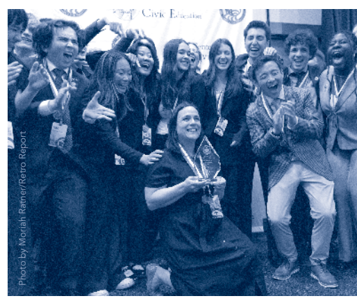
A team celebrates at the 'We the People' national championship.

Citizen Nation is an innovative new documentary series that follows teenagers from across the U.S. with diverse personal and political backgrounds as they come together to compete in the nation's premier civic competition, "We The People." Airing Tuesdays at 8 pm beginning Oct. 8, the series shadows high school students over 10 months across eight states as they grapple with critical questions about democracy. As they rise through regional and state competitions, they respond to judges' challenges in the style of Congressional hearings and reveal their knowledge of the U.S. Constitution and politics, wrestling with what it means to be a citizen today. The four-part series culminates with the championship in the nation's capital.