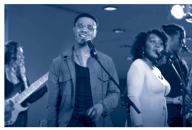
Krannert Center UNCORKED featuring Haki N' Dem on Feb. 22, 2024

This dynamic partnership also is planning an anniversary to remember! We're excited to announce that Loose Ends is coming to Champaign-Urbana to