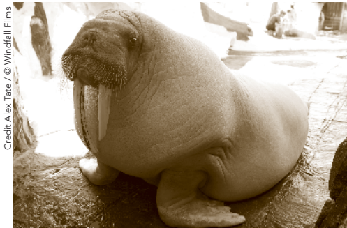
Dozer, the 3,500-pound adult male Pacific walrus, at SeaWorld San Diego.