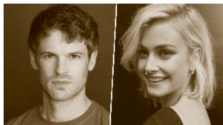
Benjamin Wainwright and Stefanie Martini star in 'Maigret' on 'MASTERPIECE.'