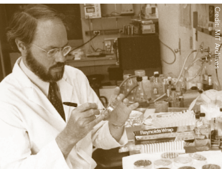
Sharp at work in his lab at MIT in the early 1980s.

A farm boy from rural Kentucky, Phil Sharp is an unlikely hero — from humble beginnings to a Nobel prize-winning discovery that sparks the biotechnology industry, catalyzing drug discovery that helped 7 billion people in 2024 alone.