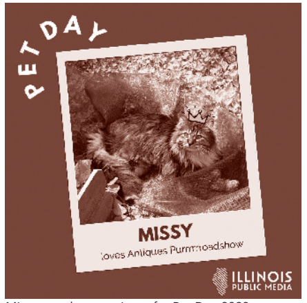
Missy was the top winner for Pet Day 2023.

and followers a chance to vote for their favorites on Pet Day (Sept. 24). The pet