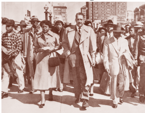
Thurgood Marshall leaves federal court in Birmingham, Alabama, on Feb. 29, 1956.

The film centers on Marshall’s own voice, drawn from a rare oral history. It also includes exclusive interviews with family members, leading historians and authors, and legal experts who offer fresh insights into his life and extraordinary influence.