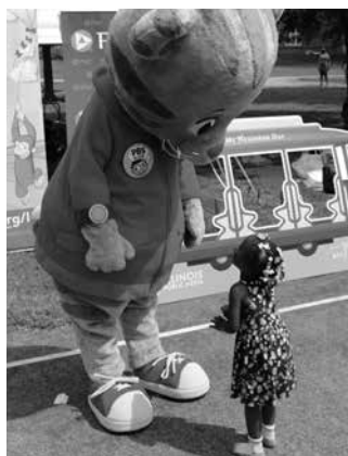
Daniel Tiger at Be My Neighbor Day.

T raditionally at the end of each year we reflect on the accomplishments and wonderful memories made over the past 12 months and look to the possibilities and goals of the year to come. 2022 is no exception, but how do you sum up a year in which we celebrated a century of making waves here in central Illinois and sometimes across the country?