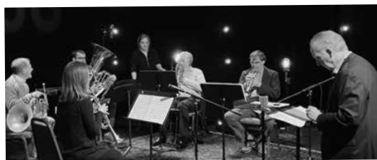
Brass musicians — all University of Illinois and Eastern Illinois University faculty members — record the WILL Centennial Fanfare in the TV studios.

We hope you will consider a year-end gift as a lasting way to help us celebrate this milestone. Your gift will also help ensure public media's future here in central Illinois. To make a gift, visit willgive.org (QR Code below), or mail a check in the enclosed envelope. We are thrilled to have had the chance to celebrate with you, and we look forward to serving our community for the next century.