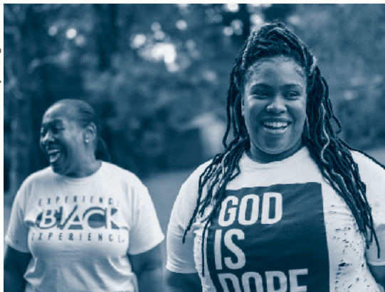
Novelist Angie Thomas with her mother in her childhood neighborhood in Jackson, Mississippi.