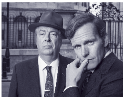
From left, Roger Allam as Fred Thursday and Shaun Evans as Endeavour Morse.

Endeavour on MASTERPIECE comes to a brilliant end in its ninth and final season beginning at 8 pm Sunday, June 18. Shaun Evans as the young Morse and Roger Allam as his superior officer face intriguing new crimes, including an unsolved case linked to the past. With characters from former seasons popping up in a grand finale, Morse must resolve his professional and romantic future.