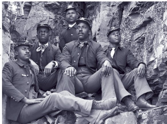
A group of soldiers from Fort Missoula.