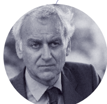
Inspector Morse (1987-2000)