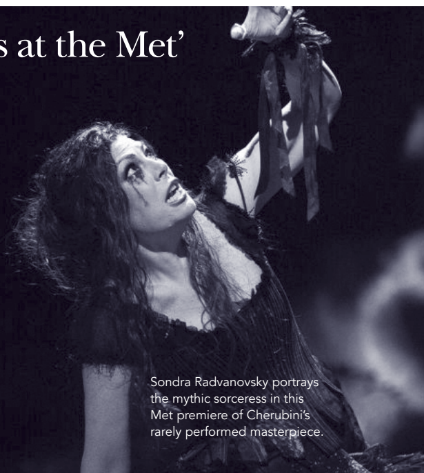
Sondra Radvanovsky portrays the mythic sorceress in this Met premiere of Cherubini's rarely performed masterpiece.

Great Performances at the Met presents Medea at 8 pm Friday, June 16. Sondra Radvanovsky portrays the mythic sorceress in this Met premiere of Cherubini's rarely performed masterpiece. This marks Radvanovsky's fourth new production with director David McVicar, who also designed the sets for this staging. Joining Radvanovsky are tenor Matthew Polenzani as Medea's husband, Giasone; soprano Janai Brugger as her rival for his love, Glauce; bass Michele Pertusi as her father, Creonte, the King of Corinth; and mezzo-soprano Ekaterina Gubanova as Medea's confidante, Neris. Maestro Carlo Rizzi conducts. Joyce DiDonato hosts.