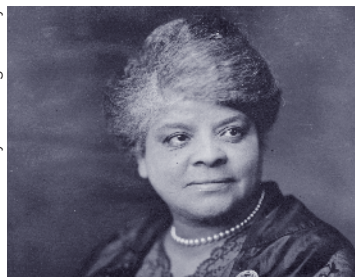
Ida B. Wells