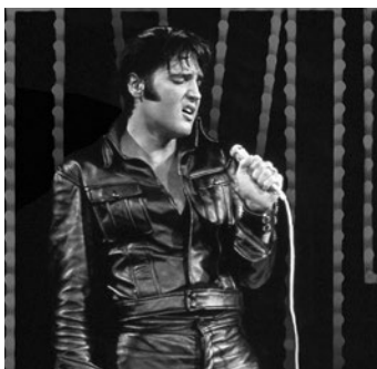
Elvis Presley in his 1968 taped television special.

Experience the magical moments of Celine Dion's record-breaking, sold-out 2008-09 world tour in Celine Dion: Taking Chances World Tour – The Concert at 9:30 pm Sunday, March 12. The concert featured her greatest hits, from the energetic "I Drove All Night" to the moving and emotional grand finale ballad "My Heart Will Go On."