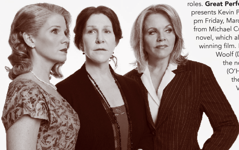
From left, Kelli O'Hara, Joyce DiDonato, and Renée Fleming

In her highly anticipated return to the Met, soprano Renée Fleming joins soprano Kelli O'Hara and mezzo-soprano Joyce DiDonato to portray three women from different eras who grapple with their inner demons and their societal roles. Great Performances at the Met presents Kevin Puts' The Hours at 8 pm Friday, March 17. It is adapted from Michael Cunningham's acclaimed novel, which also inspired the Oscar-winning film. In the opera, Virginia Woolf (DiDonato) is writing the novel, Laura Brown (O'Hara) is reading it in the 1950s, and Clarissa Vaughan (Fleming) is re-enacting its plot in late-20th-century Manhattan.