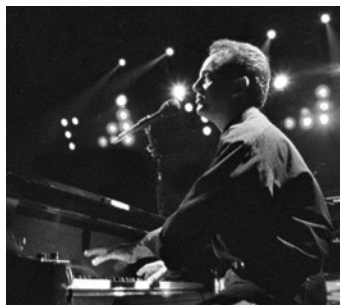
Billy Joel performing at his 1990 concert at Yankee Stadium in The Bronx.