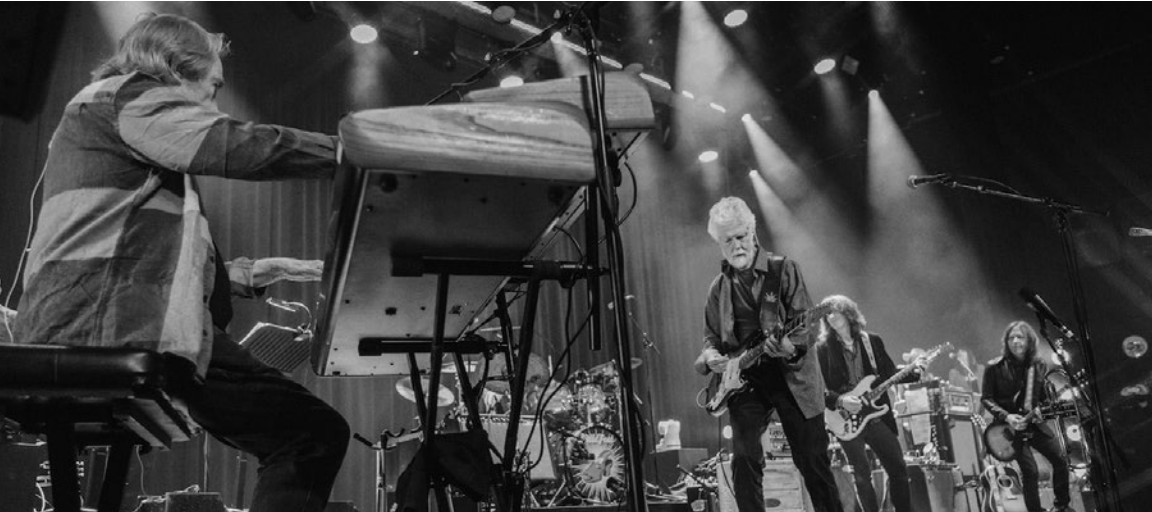
Little Feat at the Ryman Auditorium in Nashville, Tennessee, in March 2022.