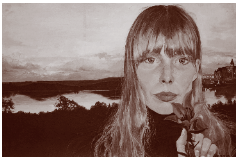
Self portrait by Joni Mitchell

Joni Mitchell will receive The Library of Congress Gershwin Prize for Popular Song 2023 at an all-star tribute concert in Washington, D.C., that will air at 8 pm Friday, March 31. While her early music is often categorized as "folk," her sound draws as much from jazz, classical, and rock as she crossed various musical genres. She also redefined the role of female musicians as she oversaw all aspects of her albums, including songwriting, arrangements, performance, production, and artwork.