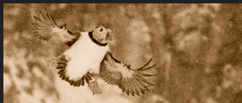
Having spent the winter out at sea, an Atlantic puffin ( Fratercula arctica ) returns to its breeding colony on the island of Hornøya, Norway.

Immerse yourself in the breathtaking landscapes of Scandinavia. Wild Scandinavia , a three-part series that airs Wednesdays at 7 pm beginning May 10, explores a different captivating natural world in each episode: the hauntingly beautiful coast, the magical seasonal forests, and the volcanic and arctic extremes. Surprising wildlife stories of lynx and puffins, orca and wolves reveal the resilient spirit of Scandinavia. Myth and modernity co-exist. Odin and Thor, base jumpers, and reindeer herders are all woven into this icy natural world.