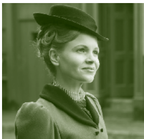
Kate Phillips as Miss Scarlet

Masterpiece Mystery has delighted PBS viewers for decades with incredible productions featuring intriguing sleuths, detectives, villains, and heroes. It brings the greatest crime novels ever written to the screen, while creating fresh classics for a new generation. As rich as its history is, Masterpiece Mystery continues to grow and evolve. The fall 2022 Masterpiece Mystery season