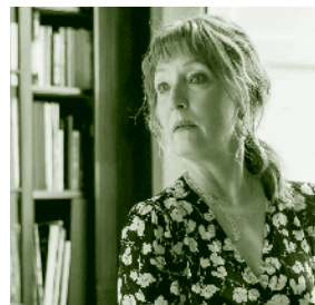
Lesley Manville as Susan Ryeland in ‘Magpie Murders.’