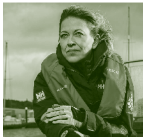
Nicola Walker as Annika

And go behind the camera with Miss Scarlet and the Duke: Secrets Revealed at 9:30 pm Thursday, Nov. 24, and at 7 pm Nov. 27.