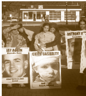
Liberty vs. Security: Domestic Policy Post 9/11 (episode 3, Sept. 25) explores the government response to the attack. Above, an AWARE anti-war protest against the U.S. invasion of Iraq was held at the courthouse in Urbana.