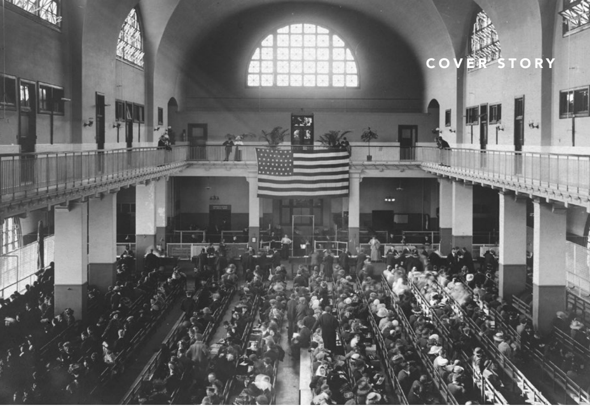
Immigrants seated at Ellis Island