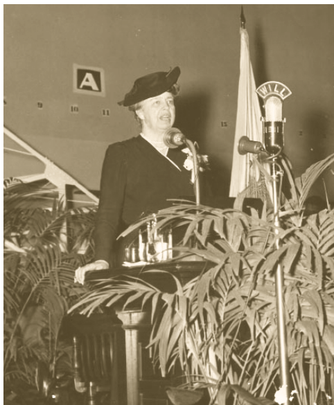
Eleanor Roosevelt speaks at the University of Illinois' Farm and Home Week in 1942.

isolated homes now had access to world news, up-to-date and detailed weather reports, entertainment, and agricultural programs. With this justification, many farmers bought battery-operated radio sets that could be charged at a local garage or by using a wind charger or a stationary gasoline engine belted to a generator.