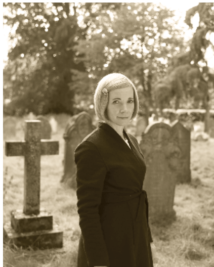
Lucy in graveyard at Walsham le Willows.

Popular British historian Lucy Worsley continues to explore some of British history’s most perplexing mysteries in Lucy Worsley Investigates . Using historical and contemporary evidence and expert testimony she reframes the past and deepens her analysis. At 9 pm Sunday, Sept 4., Princes in the Tower uncovers the story of the disappearance of two boys in 1483 that has led to centuries of mystery and speculation. At 9 pm Sunday, Sept. 11, she uncovers Royal papers and explores how the assassination attempt on King George III changed psychiatry forever in Madness of King George . At 7 pm Sunday, Sept. 25, The Black Death examines the latest science and explores how the vast death toll from the Black Death affected religious beliefs, class structure, work, and women.