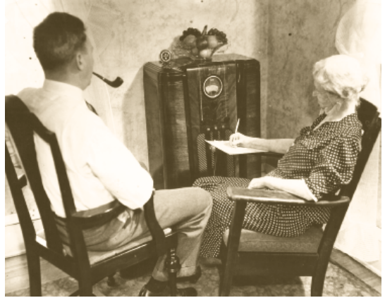
Area farmers listening to WILL in the 1930s. The woman is likely jotting down the latest market prices.

WILL has been a vital resource for area farmers since the station's inception. In fact, the first broadcast on April 6, 1922, featured a lecture titled "Turning Cream into Gold." By 1928, specialists from the University of Illinois College of Agriculture were brought on to speak about land, crops, livestock, and other issues of concern to farmers. By 1931, these informative agricultural pieces became a daily staple of WILL programming, and WILL even broadcast special events such as the College of Agriculture's annual research showcase, Farm and Home Week. In 1935, WILL began reporting daily market prices, and in 1947, WILL boasted that it was the only station in the state with a full hour of farm programming and that it carried a more comprehensive market report than any other station.