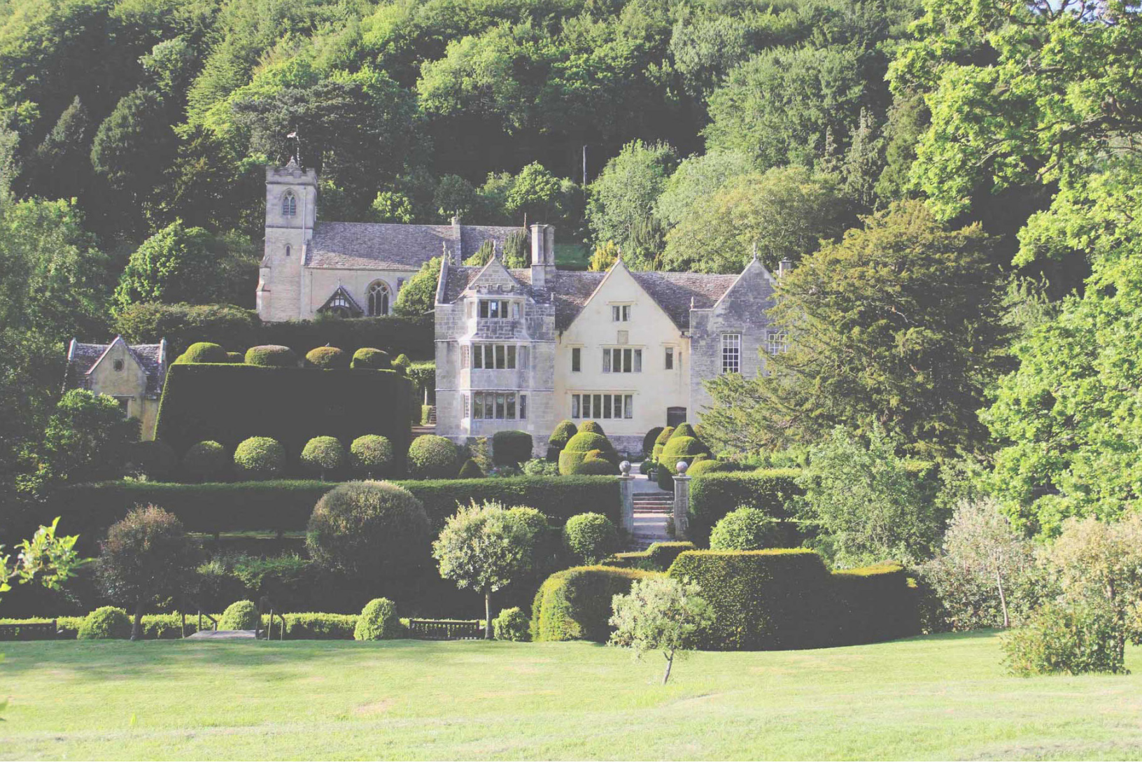
London Extension Option

Enjoy two extra days in London, at an additional cost of $571 per person based on double occupancy or single room at $958.