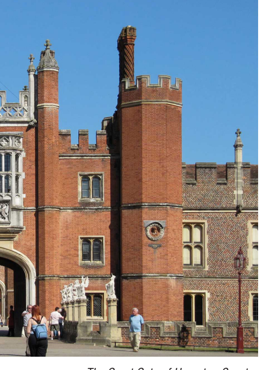
The Great Gate of Hampton Court