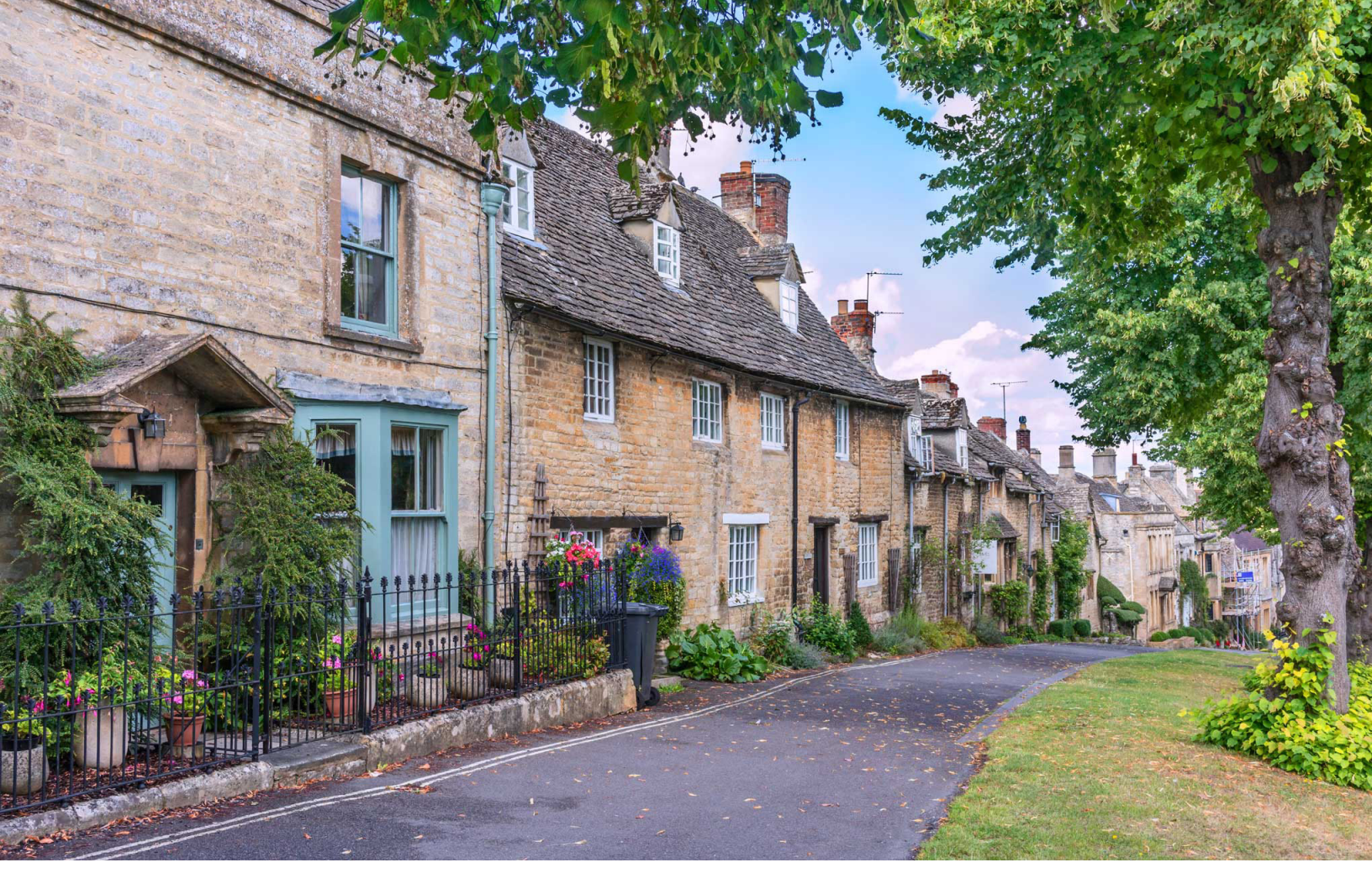
The Cotswolds, charming villages made of honey-coloured stone