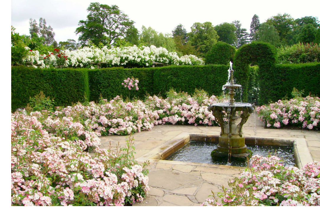
Hever Castle Gardens

Free time for lunch is provided before we gather again to drive to Sheffield Park Garden, owned by the National Trust. The park was originally designed by Lancelot "Capability" Brown in the 18th century and later expanded by the home's various owners. Four ponds with water lilies form the garden centerpiece surrounded by