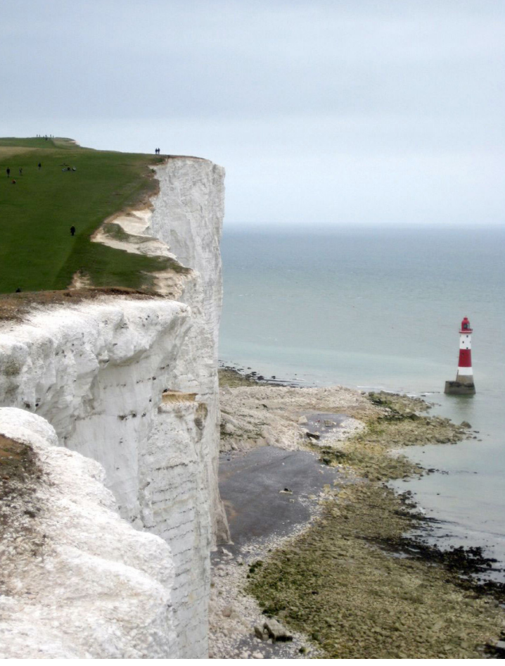
The Beachy Head Lighthouse near Eastbourne on the English Channel

Not otherwise open to the public, we are given a private tour of a Tudor masterpiece, Owlpen Manor. The estate only started changing hands in 1924 after a thousand years in the family.